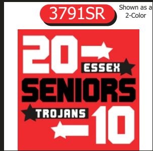
3791SR Shown as a 2-Color