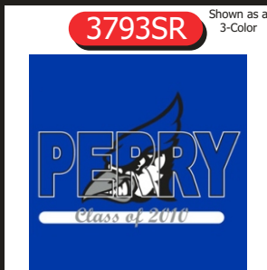
3793SR Shown as a 3-Color