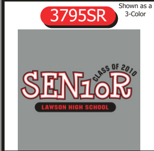
3795SR Shown as a 3-Color