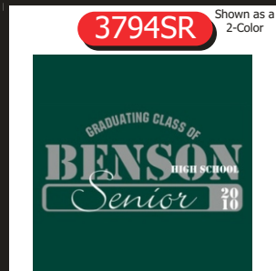
3794SR Shown as a 2-Color