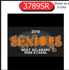
3789SR Shown as a 3-Color