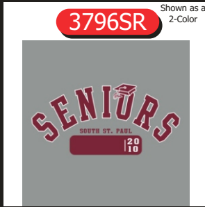
3796SR Shown as a 2-Color