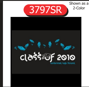
3797SR Shown as a 2-Color